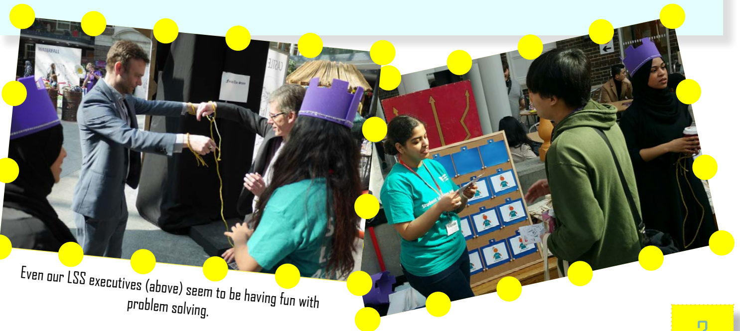
Even our LSS executives (above) seem to be having fun with problem solving.

Students were not only able to showcase their skills and talents, develop strategies to cope with their nerves when speaking publicly, but also learn to challenge their abilities. - Paige McNish (BA Education Studies)