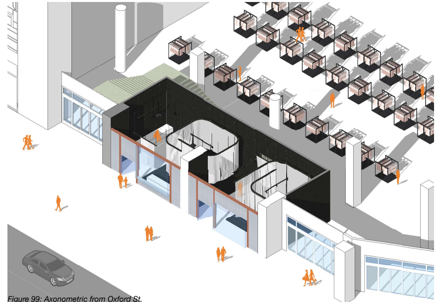
Figure 99: Axonometric from Oxford St.